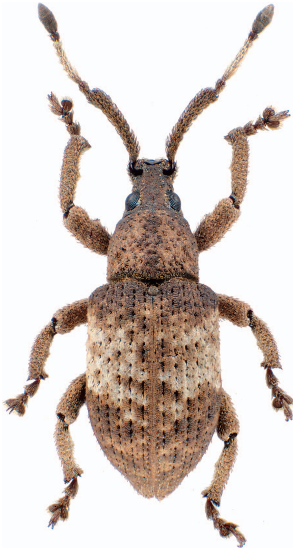
Fig. 1. Habitus photograph of Amyllocerus wakaharai sp. nov., male.

Type materials. Holotype: male, 12 km E. Phongsawang (alt. 1,200 m), Xi-